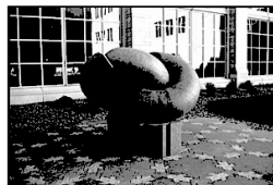
(90%) PSNR = 15.42