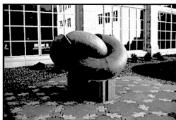
(95%) PSNR = 18.46